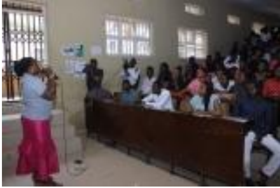
Picture Showing Program Director Giving Message to the Students