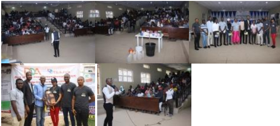
OTHER PICTURES OF THE PICTURE